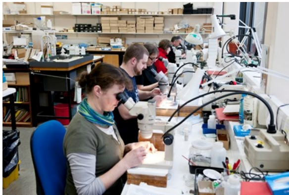
The Rothamsted Insect Survey at Work