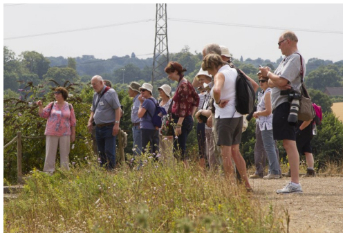
Some new members on the afternoon walk.

Ten minutes later Liz spotted a Clouded Yellow, nectaring on Birds-foot Trefoil. Small Copper, Marbled White, Small and Essex Skipper, Large, Small & Green-veined White, Meadow Brown and Gatekeeper were also seen in the meadows, plus very many 6-spot Burnet moths. In the gardens, Peacocks were numerous on the Buddleias, with Small Tortoiseshell, Painted Lady, Brimstone and Red Admirals also seen. This site is maturing well and certainly living up to its early promise.