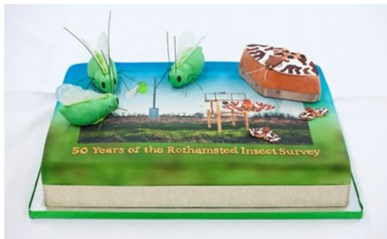
50th Anniversary Birthday Cake