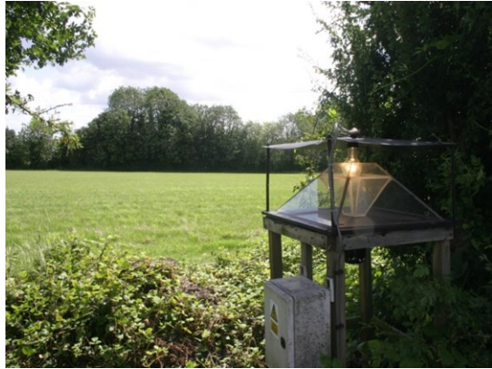
Rothamsted Light Trap