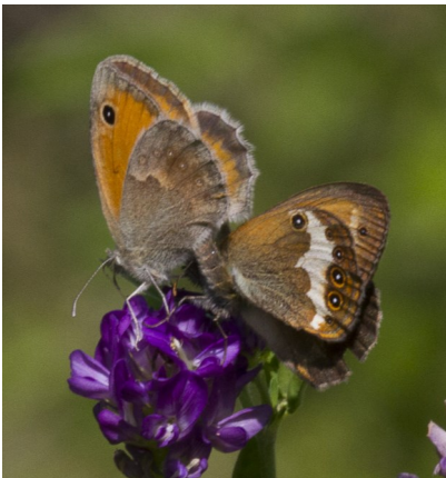
Pearly Heath attempting to mate with Small Heath (left) and Ripart's Anomalous Blue (right).

Has anyone else seen this behaviour in this, or other, butterfly species?