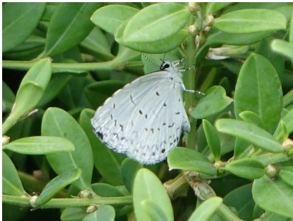
Summary Azure